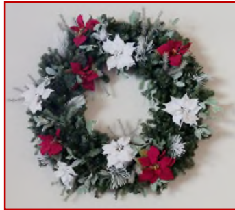
The November Social was focused on decorating for Advent plus enjoying Chili and one of the many Soups!