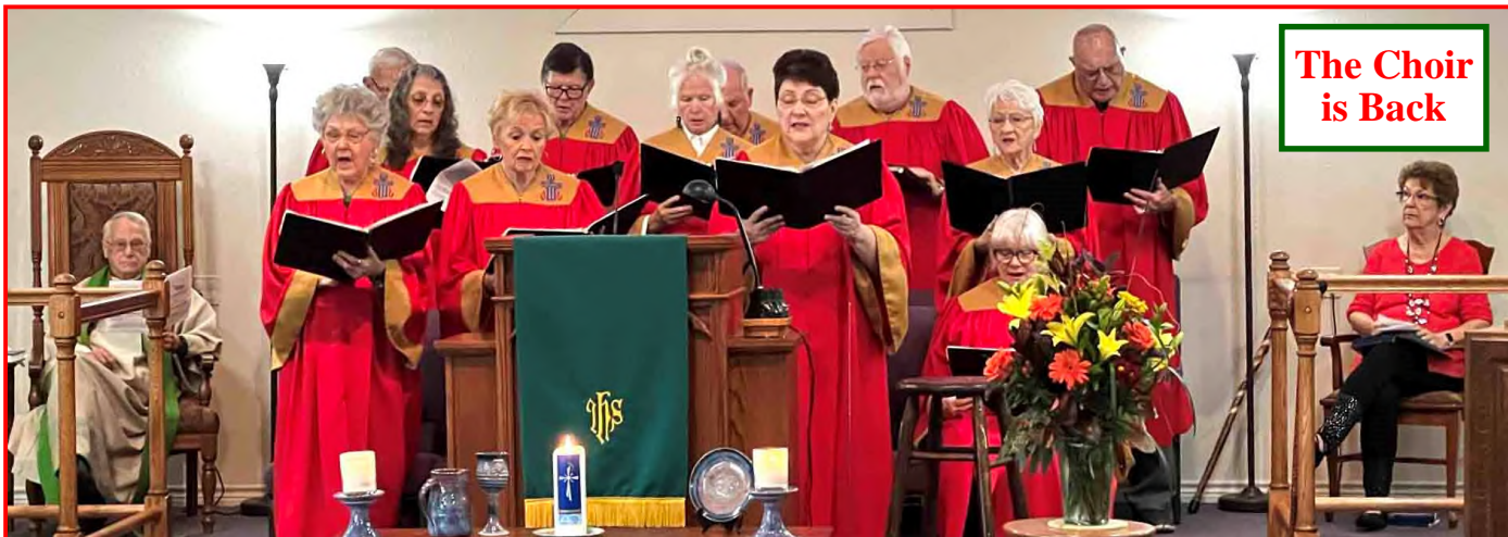
The Choir is Back